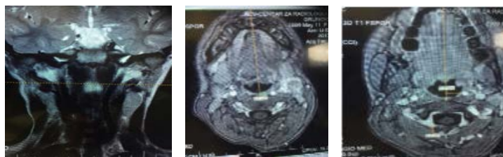
Fig. 1 – Magnetic resonance imaging (MRI) angiography of the head and neck showing an abnormal position of the left internal carotid artery (ICA) extending submucosally to the posterior wall of the pharynx.

overlapping toes as low growth. Cardiological examination revealed the aberrant left ventricular horde and mitral valve dysmorphism that were consistent with the described syndrome. Kidney ultrasonography showed a fibrotic band of left kidney with ruptured cysts. Pharyngoplasty was dismissed because of the risk of serious postoperative complications. The mother was explained that the child should be included in speech therapy with limited possibilities. Furthermore, the basic principles of rehabilitation of VPI were also explained, as well as that the rehabilitation would take a long time. The parents were also explained that without surgical treatment of VPI, rehabilitation could not give satisfactory results. In December 2018 (3 months before surgery), speech therapy status was estimated as follows: spontaneous speech – fluent with partially impaired articulation and phonation. Assessing articulation and discrimination of votes revealed distorted pronunciation of a certain number of votes: pronunciation of vocals /I/ and /U/ in certain positions with nasal voices; the substitution of sonic consonants with silent pairs or nasals was present. The pronunciation significantly improved with occasional substitu-